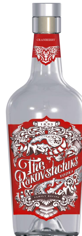
Special vodka «Klykvennaya» (Cranberry)