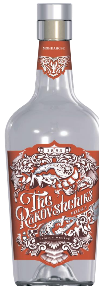
Special vodka «Monpansie»